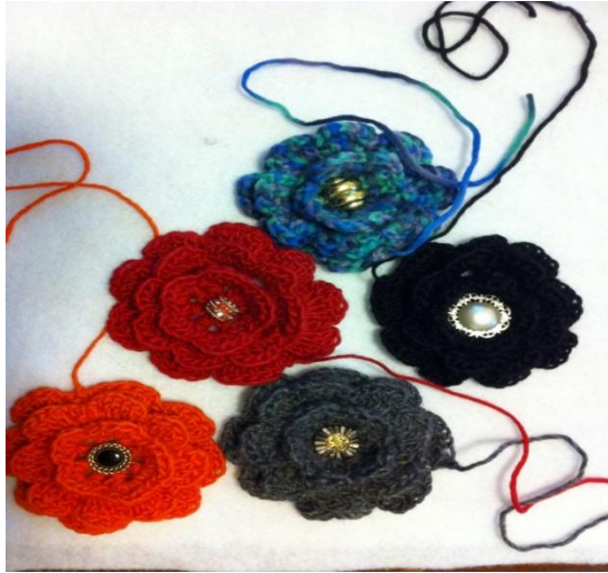
Transcribed from YouTube Video made by epicabundance